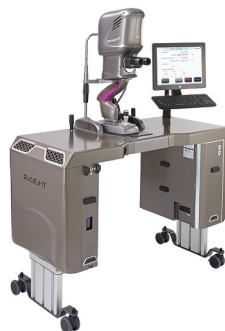
Light Delivery Device (LDD)